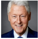
President Bill Clinton 42nd President of the United States; Founder & Board Chair, Clinton Foundation