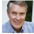
Senator William H. Frist, M.D. Former Senate Majority Leader